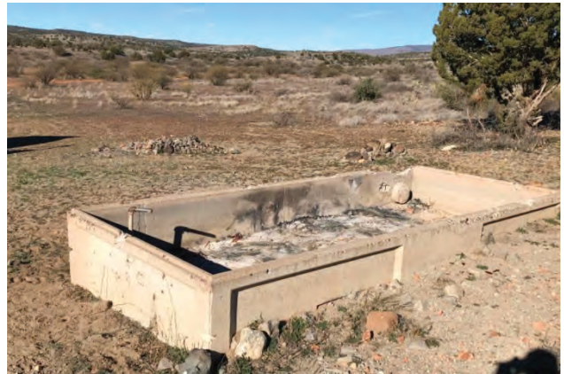
Figure 1. Photo of the vandalized Triangle Trough.

Upon completion, a Forest Service representative will inspect the trough and document all changes.