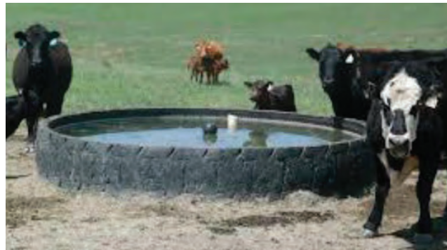
Figure 2. Photo of tire tank example. Similar to what is proposed to replace the Triangle Trough.