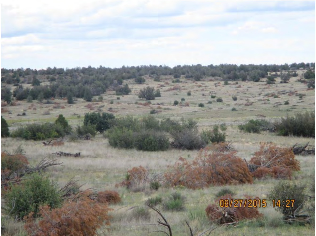
Example of K Four Private Land juniper treatment adjacent to project area.

The area adjacent to the project area on private land has had extensive vegetation treatments and the results are very favorable for wildlife.