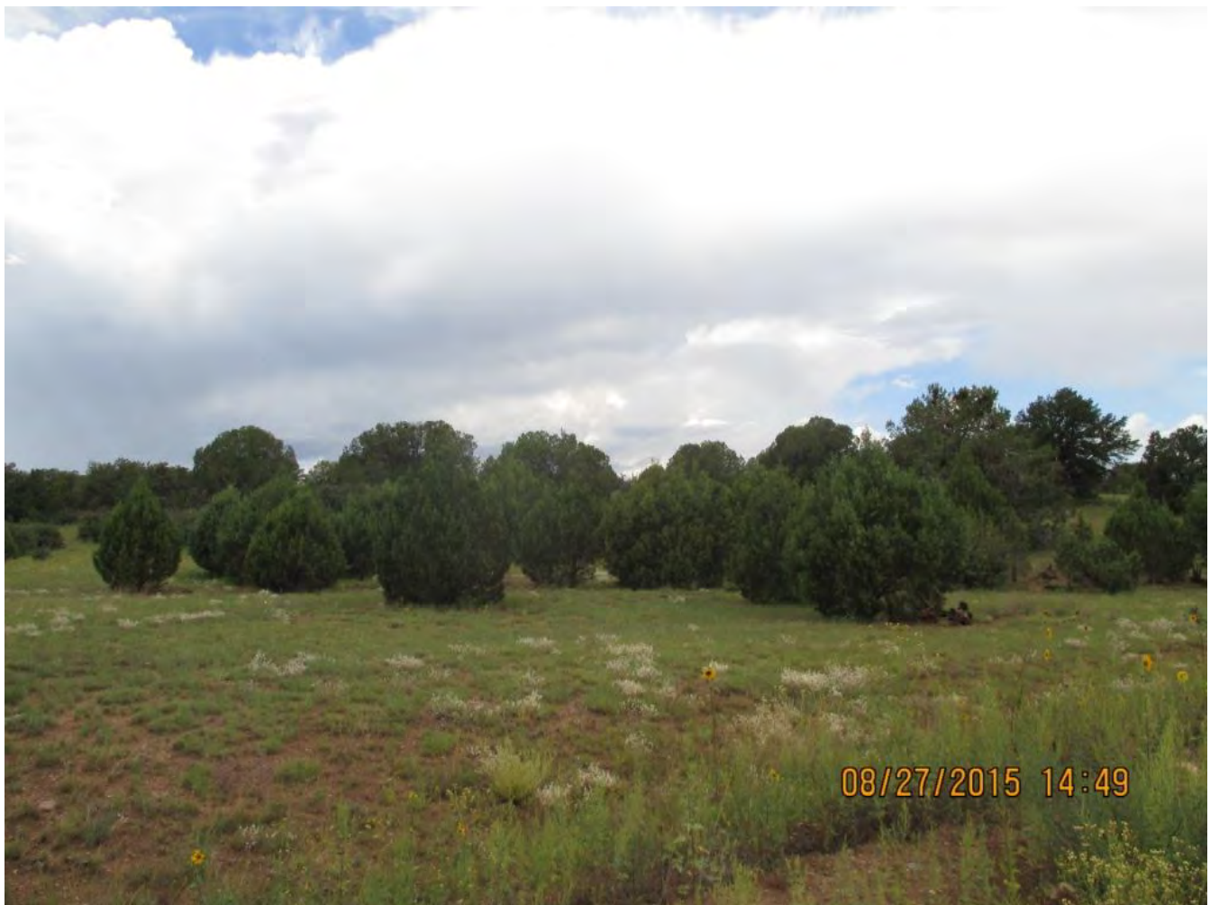
Example of K Four USFS Allotment without juniper treatment.

Canopy cover from shrub species is moderately to extremely thick in some locations to the extent that herbaceous forage is reduced or absent. A substantial portion of the forage base in the project area is provided by desirable browse species such as mountain mahogany, deerbrush, Apache plume, and silktassel. Perennial grasses can be locally abundant, especially in juniper woodlands that have been previously treated to remove the juniper overstory.