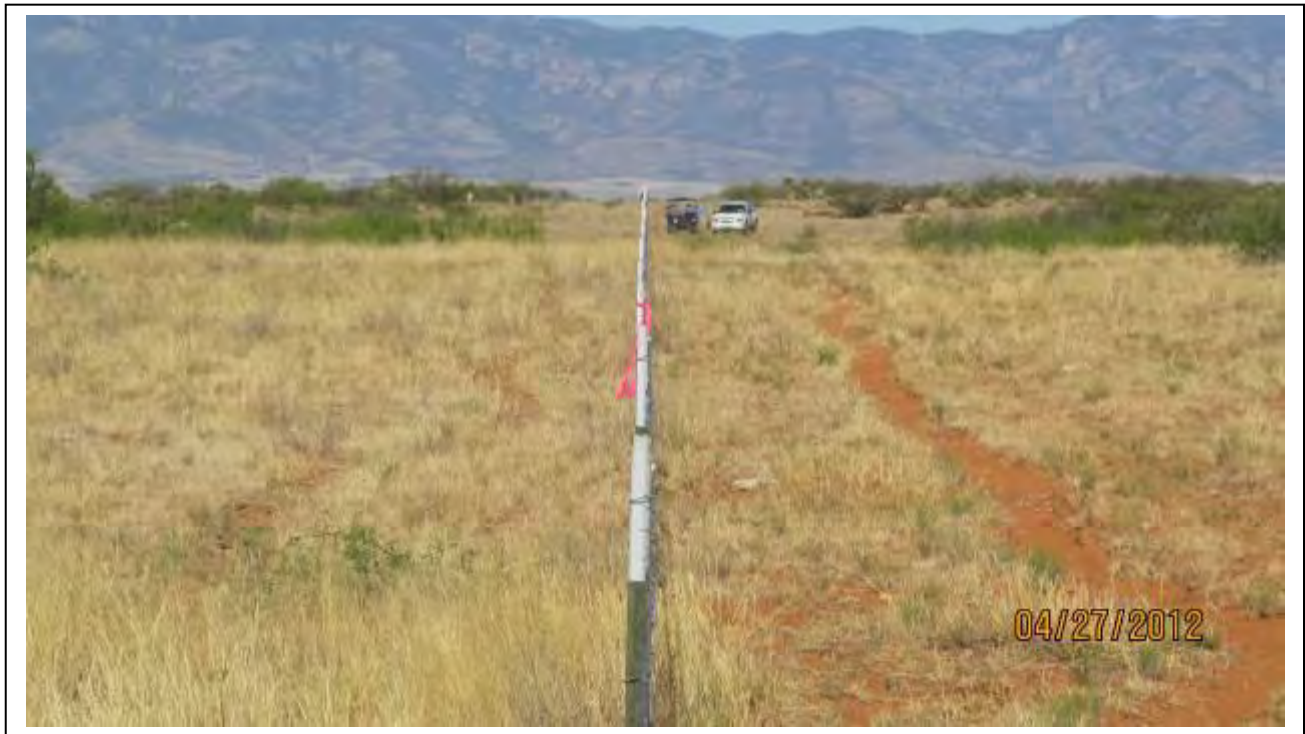
Photo of habitat conditions and project site (on right side of fence line).

The project area is remnant, semi-desert grassland with heavy invasion of mesquite-shrub dominance community at around 4600 feet.