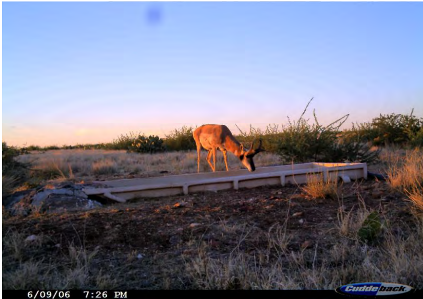
Photograph 3. Pronghorn using an in-ground recessed drinker.

An additional storage tank will take pressure off of the underground pipeline to make it more durable. Due to the elevation differences between the well site and drinker locations, storage tanks are an important component of this system. There are currently two storage tanks, and one additional 10,000 gallon storage tank is proposed.