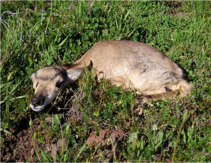
Photograph 2. Pronghorn fawn in an area adjacent to the project area on 2Y Ranch.

To change the current situation, the 2Y Ranch Solar Project would seek to modify the current system used to get water on top of the mesa. With HPC/AGFD funding, a solar pumping system is currently being installed in the existing well to make the water source more reliable. Without having to travel to the well location on a daily basis to fill a generator with gasoline, the permittee will be able to keep water in the system year round.