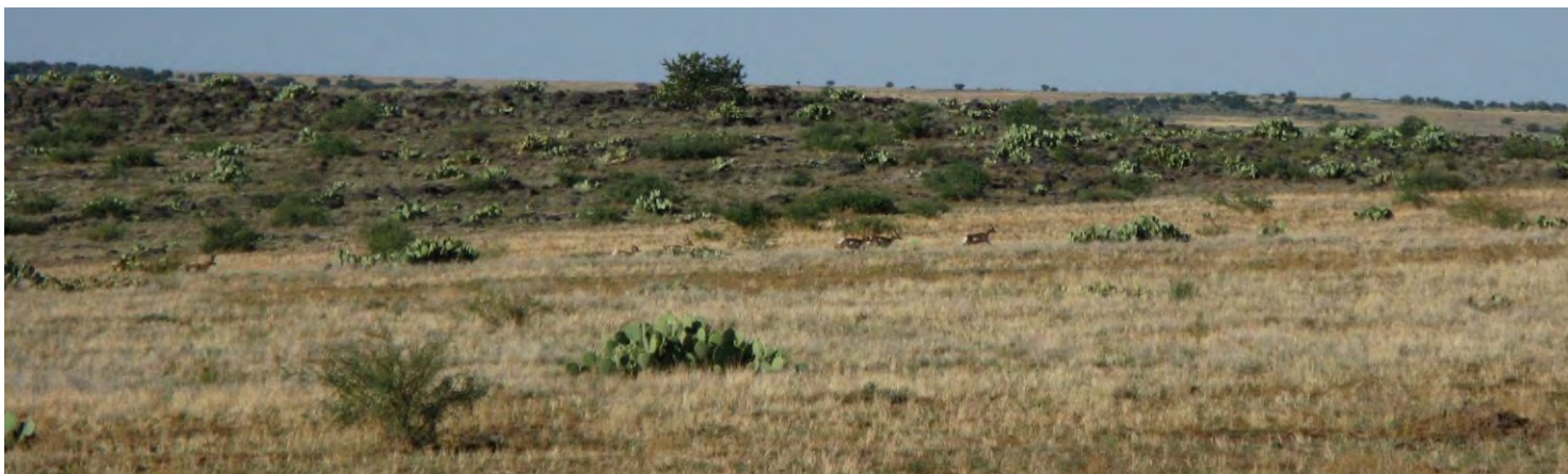
Photograph 1. Pronghorn observed near a proposed new drinker location during site visit on 07/22/08.

The Malapai Mesa area on the 2Y Ranch in GMU 21 provides excellent habitat for pronghorn, but lacks dependable year round water. Some of the five drinkers on the mesa are kept full by the permittee only during periods when cattle are present, about four months of the year. During the other eight months, pronghorn are forced to use less desirable water sources in brushy canyons, which greatly increases their risk of being taken by predators. Pronghorn are regularly seen in the area, and a group of 12 pronghorn were seen during a site visit on 07/22/08. The GMU 21 Pronghorn study identified important fawning activity taking place on the mesa during the study period from 2002-2005.