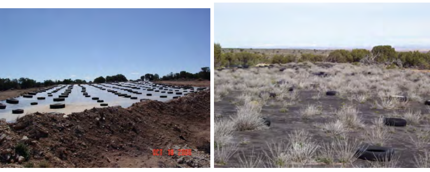
Cox Atkin Apron After

Below are some before and after photos of work that already was completed with the previous effort: