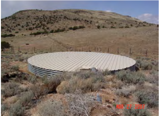
Twin Butte w/ Apron Done