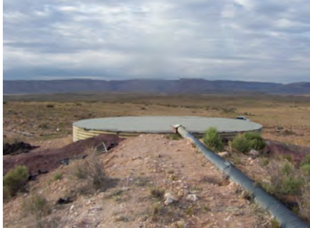
Higley Tank Lid After