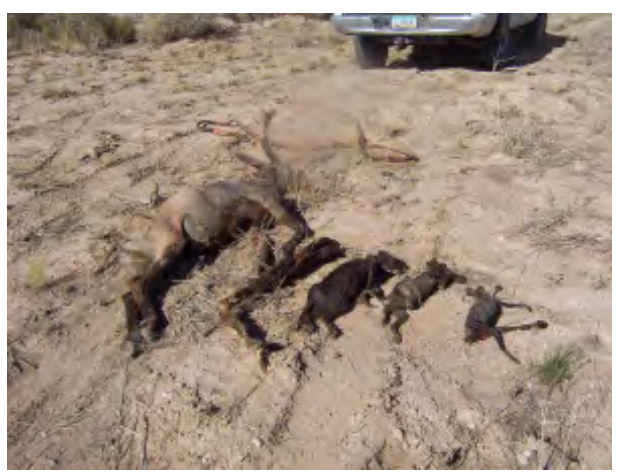
Dead Animals Removed from storage tank Twist Hills 2007: From Left to Right – Mule Deer Buck, Hind quarter of antelope, coyote, coyote, jackrabbit.

Below are some before and after photos of work that already was completed with the previous effort: