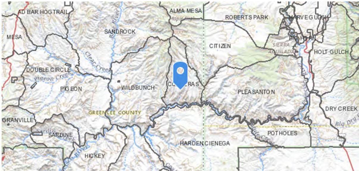
General Location (1:400,000 Scale)