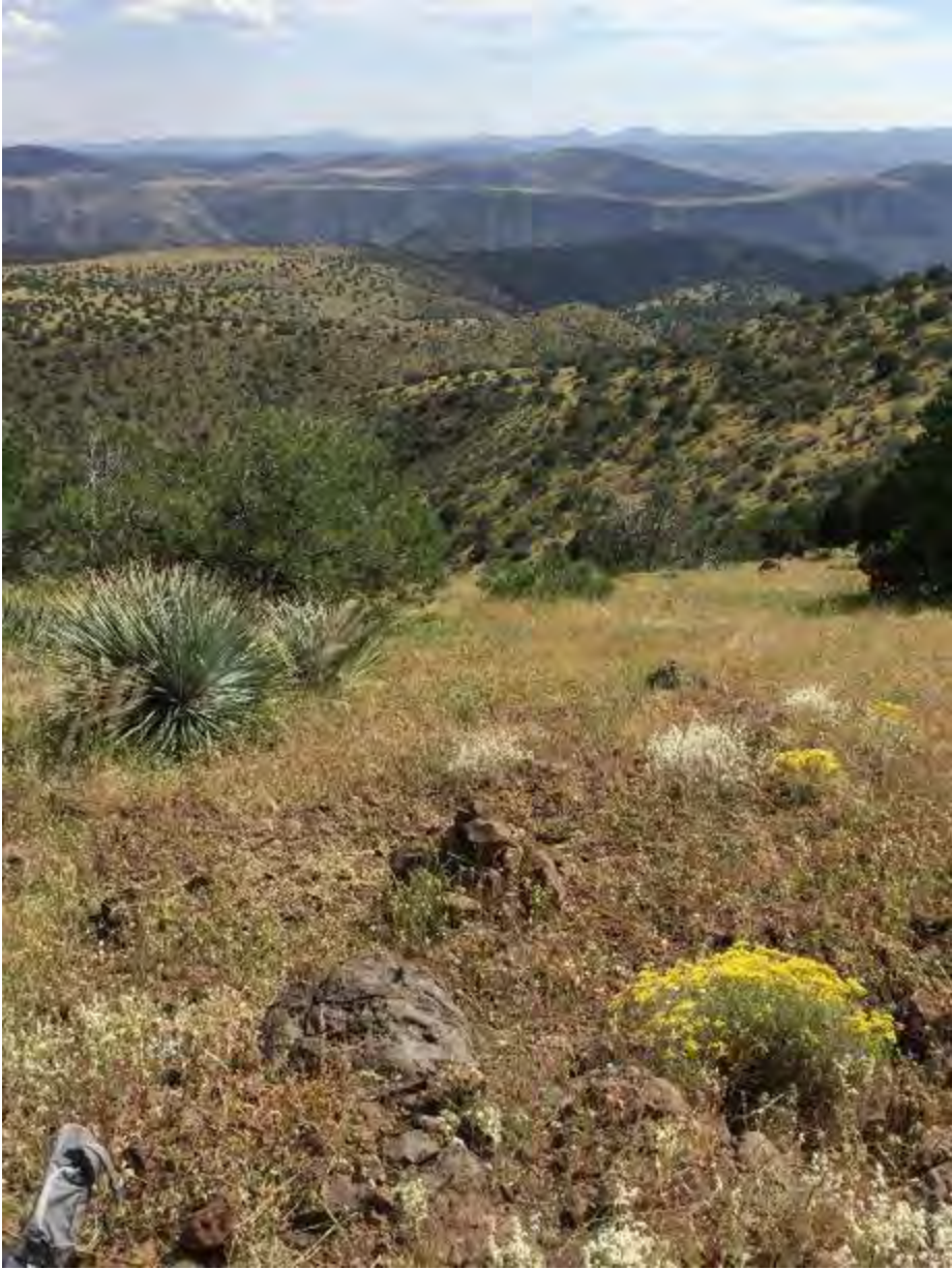
Landscape Photo Looking South