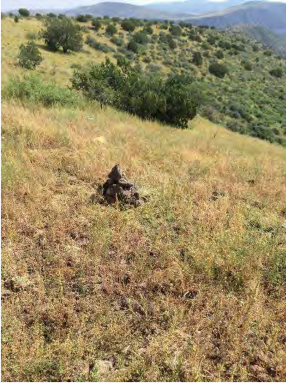
Landscape Photo Looking South