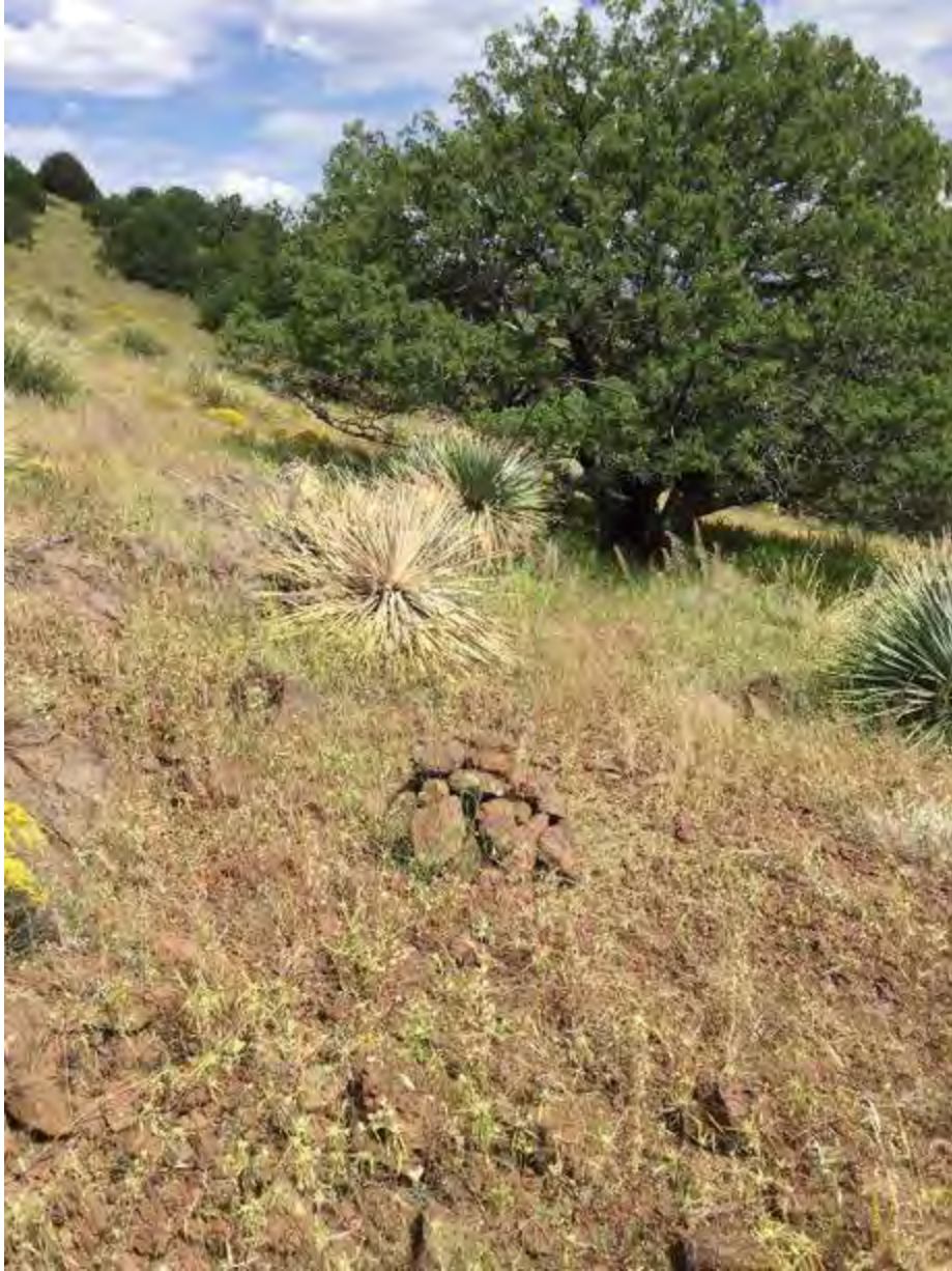
Landscape Photo Looking East