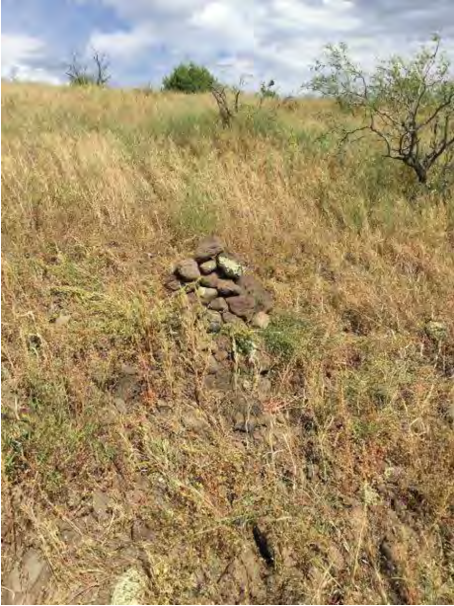
Landscape Photo Looking East