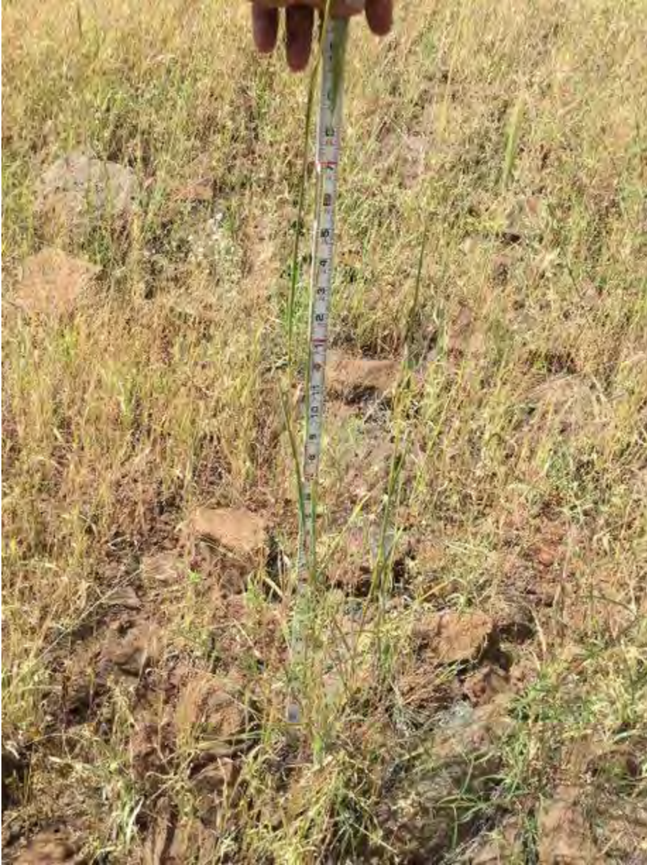
Veg height 3 bull grass