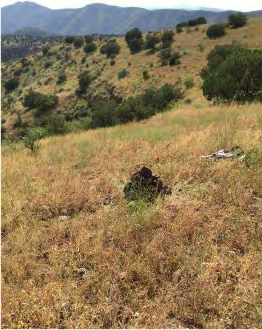
Landscape Photo Looking West