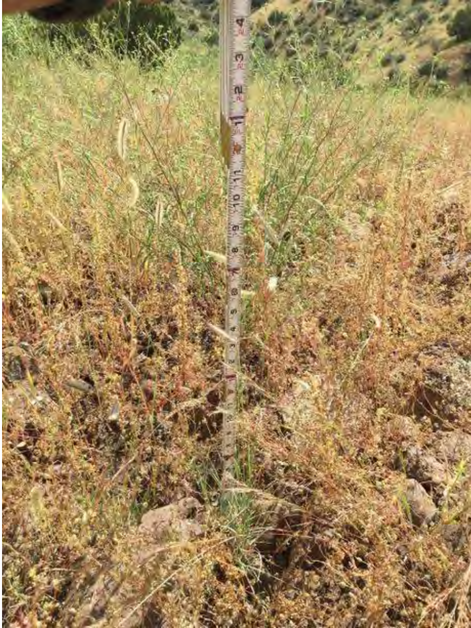
Veg height 2 gamma