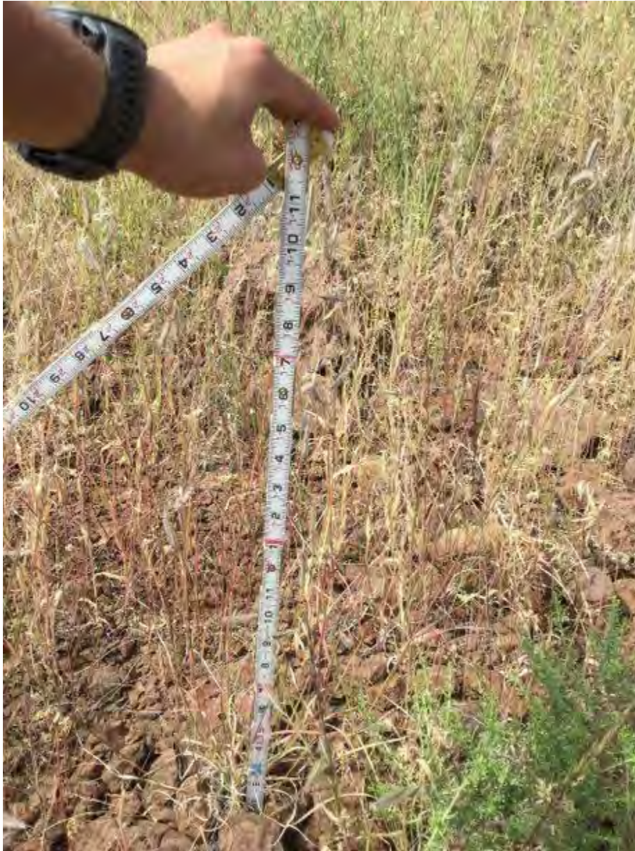
Veg Height Photo

Comment: Moderate mortality in grass, lots of bare ground