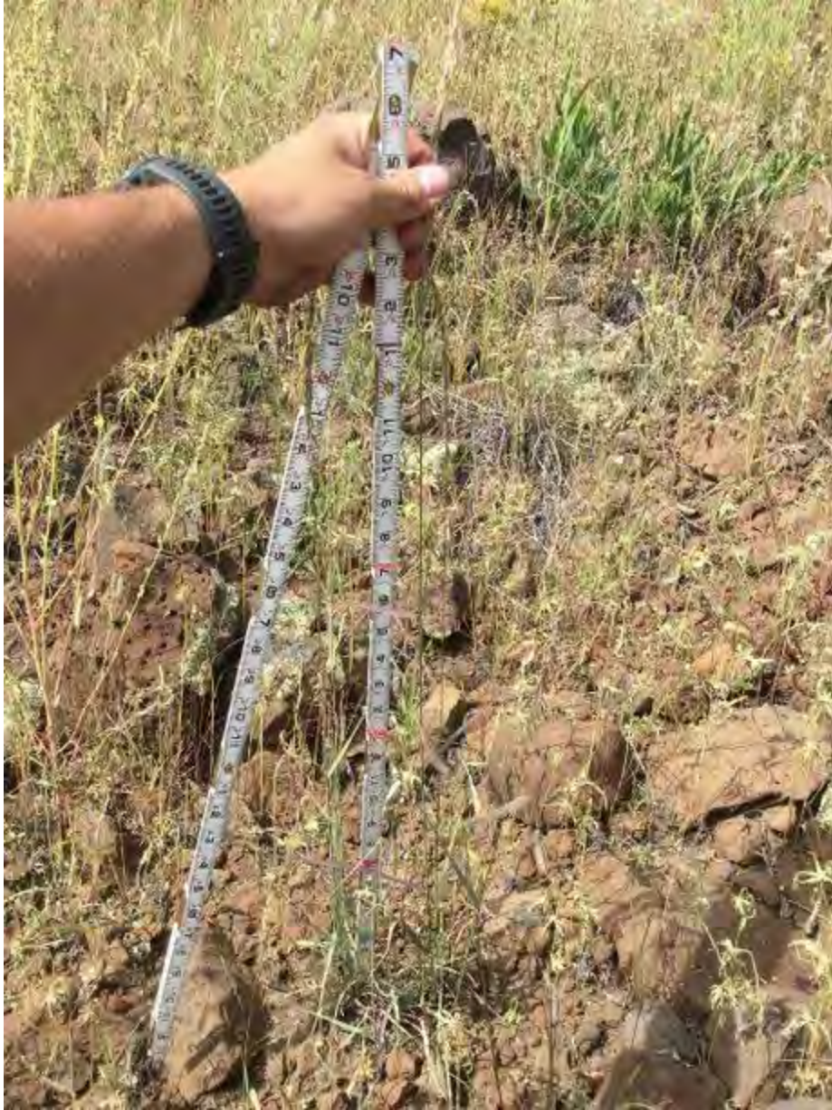
Veg height 2 side oats