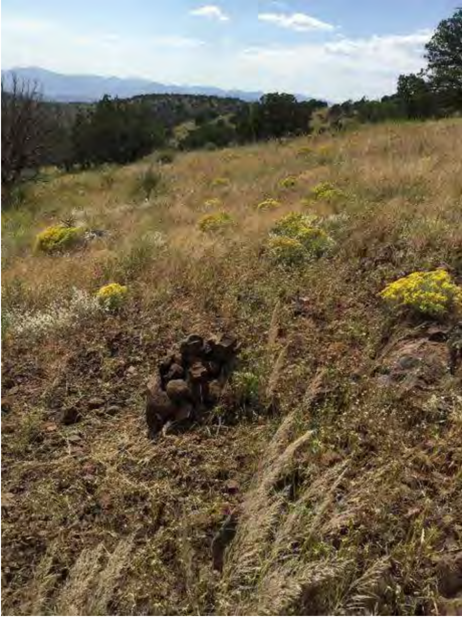
Landscape Photo Looking West