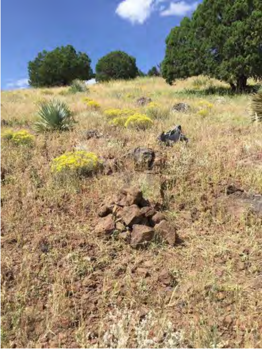
Landscape Photo Looking North