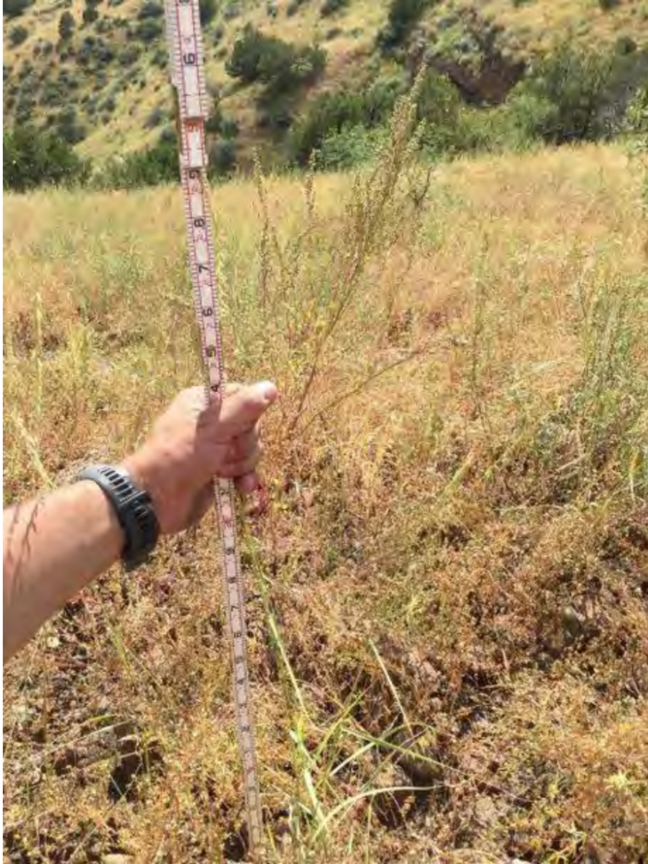
Veg Height Photo