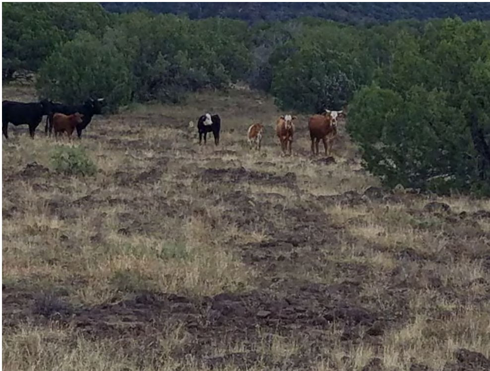
Cattle at the West Polles/ Mid Polles pasture divide. There were 15-20 animals here.

In the morning, Tyler and I split up. He went south to inspect Oak Grove pasture and I went back up on Polles Mesa. I rode west and did a loop across West Polles pasture. I came across 3 unbranded cows (appeared to be a mother with a yearling and calf). I headed off in the direction of the cattle which took me to the fence line between West and Mid Polles pasture. I followed a cow trail through the damaged fence line and located a herd of animals. There were 15-20 animals here. Some animals were branded/marked and some were not.