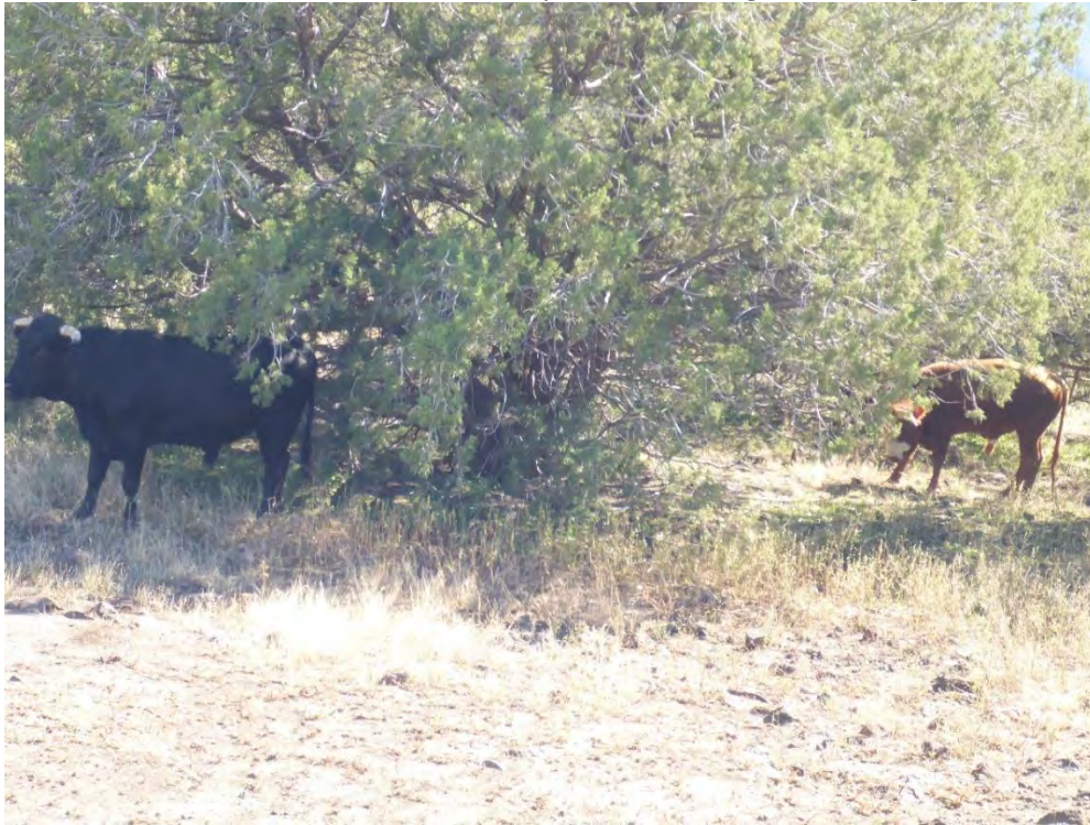
Two unbranded bulls in West Polles pasture.

Two unbranded bulls were observed at the north end of West Polles pasture. I got within 10 yards of a black horned bull and did not observe any brands, ear tags or markings.