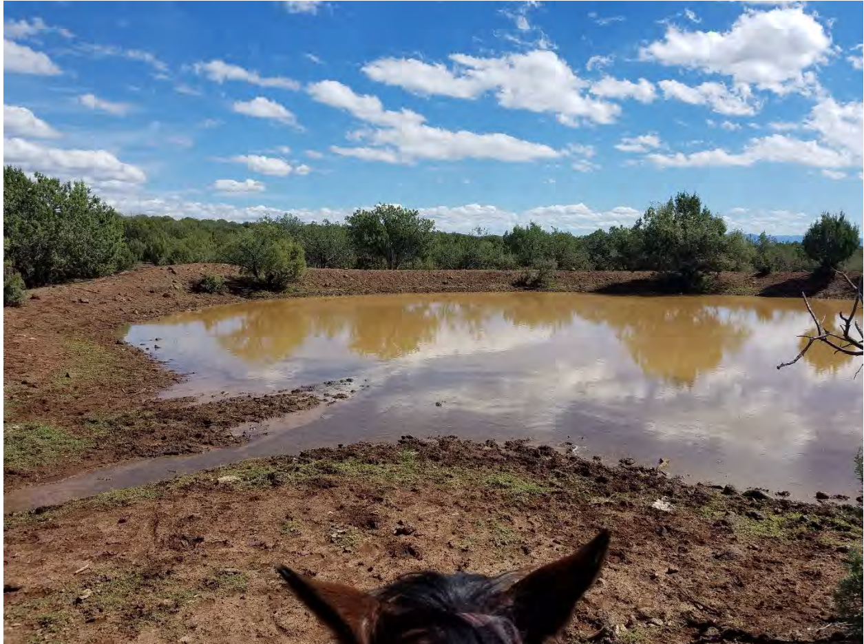
Red Saddle Tank is full and cows actively watering here. This area is not scheduled for use

We followed cattle tracks to Red Saddle Tank. The tank was full and cows are actively watering here. There is a trap surrounding the tank that has recently been repaired. There are several gates around the tank. All gates were left open.