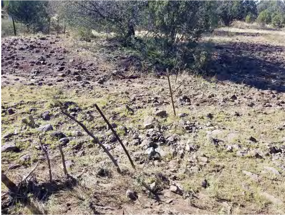
Fence down between West and Mid Polles Pastures

As we rode the northern boundary, we crossed from East Polles pasture into Mid Polles pasture, and then into West Polles pasture. The only closed gate I encountered during the entire inspection over the course of two days was found here. I did not have to open this gate to pass through because the fence was down just south of it. Fence between these pastures was down in at least 4 locations and has been for some time. There are cattle trails going through these areas (see attached inspection map).