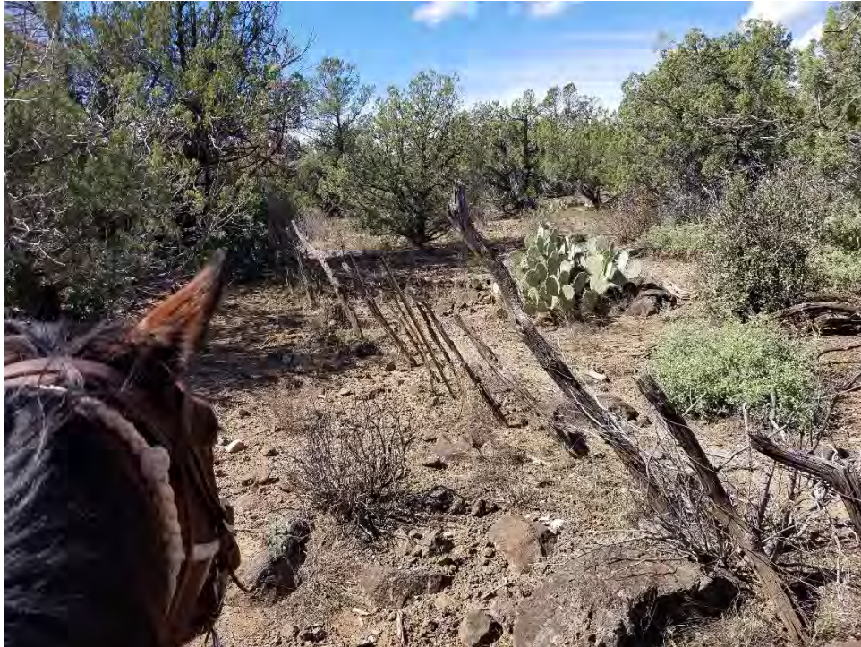
Polles Mesa- northern boundary fence. Fence is standing although in poor condition. The fence here is constructed of four single strands of smooth wire and the 5 th (bottom wire) is barbed.