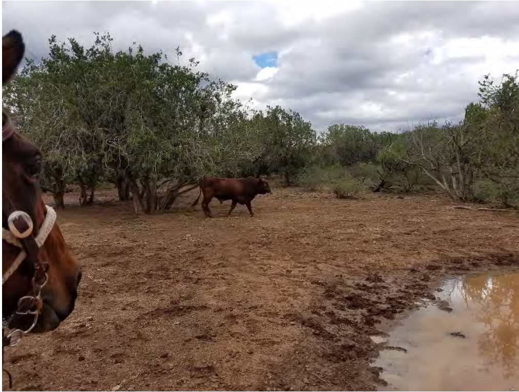
Bull at Mid Polles tank

I continued east along to Arizona Trail to Polk Springs. Adjacent to the trail, a rock gabion (used here in fence line construction) appears to have been recently been constructed using metates (Native American grinding stones). Cultural artifacts like these are protected under the Archaeological Resources Protection Act of 1979 (ARPA), which governs the excavation of archaeological sites on federal lands and removal of archaeological collections from those sites. There is likely a site nearby and the source of these grinding stones. This appears to be an egregious violation of the Act.