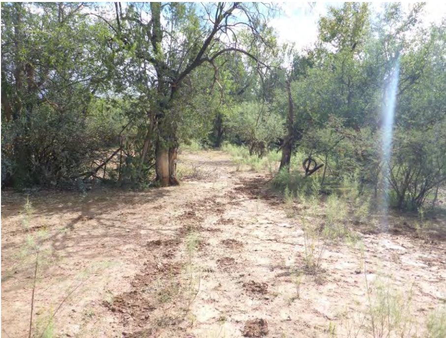
A gate left open between Pocket and LF pasture. Cattle recently passed through here.