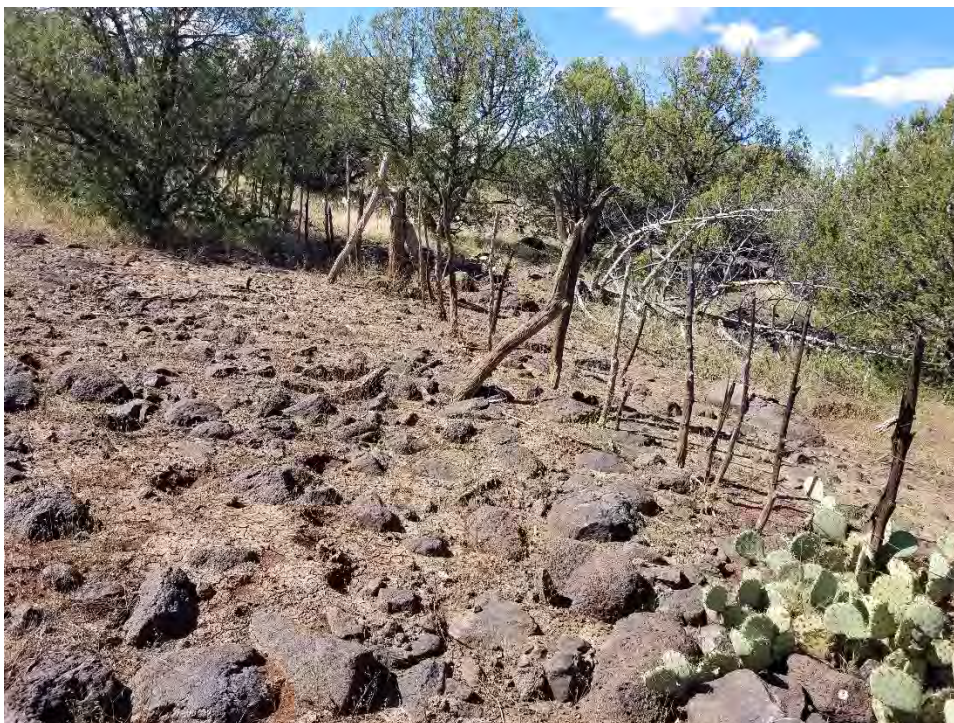
Polles Mesa- northern boundary fence. Fence stays are almost entirely wood. There are junipers leaning against the fence propping it up in places.