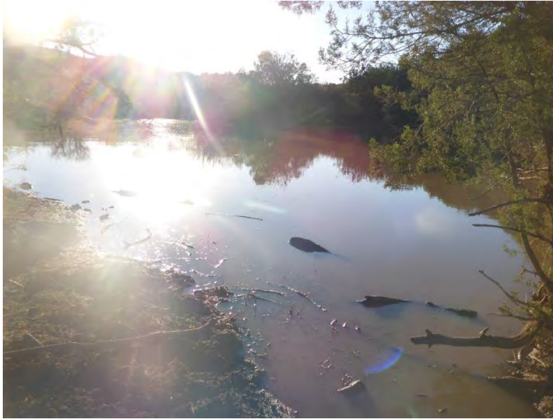
Division Fence Tank

In the morning, Tyler and I split up. He went south to inspect Oak Grove pasture and I went back up on Polles Mesa. I rode west and did a loop across West Polles pasture. I came across 3 unbranded cows (appeared to be a mother with a yearling and calf). I headed off in the direction of the cattle which took me to the fence line between West and Mid Polles pasture. I followed a cow trail through the damaged fence line and located a herd of animals. There were 15-20 animals here. Some animals were branded/marked and some were not.