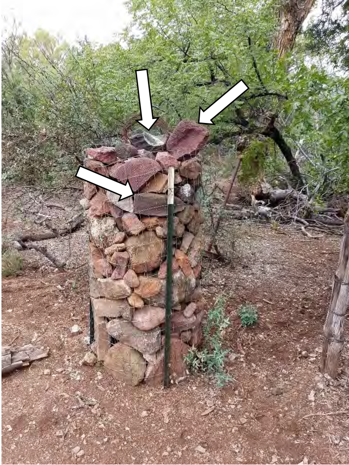
Several metates can be see displayed in a rock gabion adjacent to the Arizona Trail, next to Polk Spring.

I met with back up with Tyler nearby and we continued back to the trail head. Tyler shared with me what he saw in Oak Grove pasture. He had inspected the Oak Grove trap which was assigned to be completed by August 1, 2018. The fence around the trap was standing, although condition of the trap is poor.