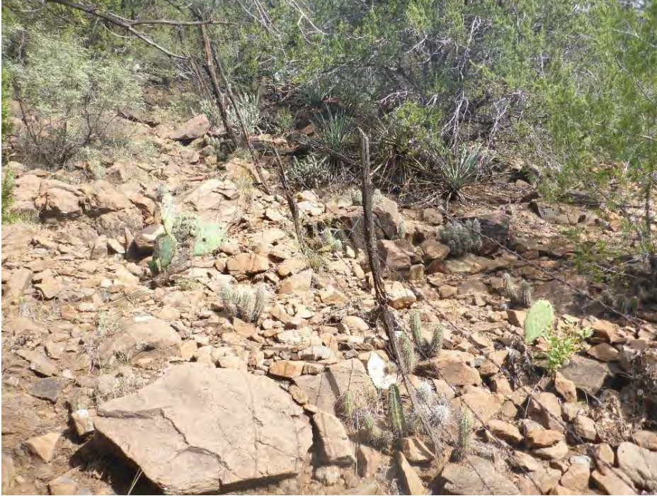
The condition of fence around Oak Grove trap is poor