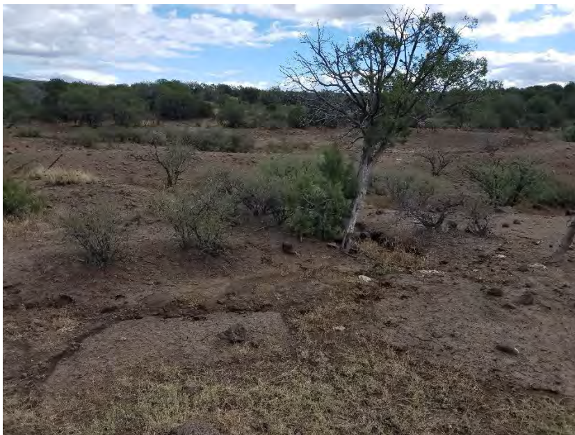
West Polles Tank is blown out and dry. Here a fence around it is down and separates West and Mid Polles Pastures