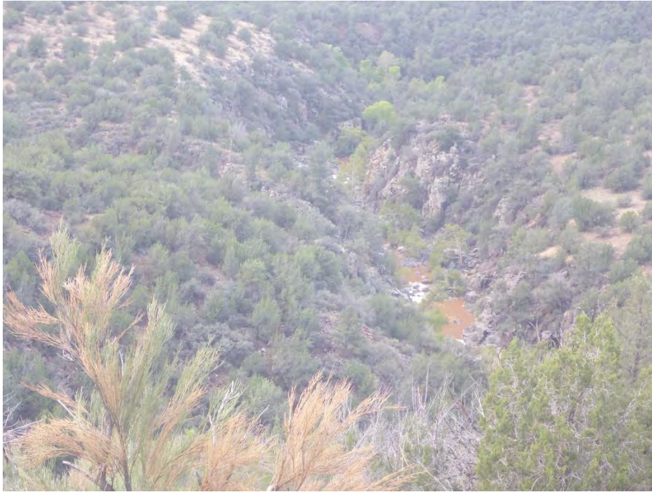
Verde River bisecting Oak Grove pasture