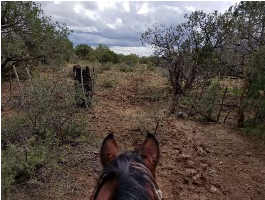
Gates open between Mid Polles and East Polles pastures. A trap next to the water lot was open and branding irons left to the side.