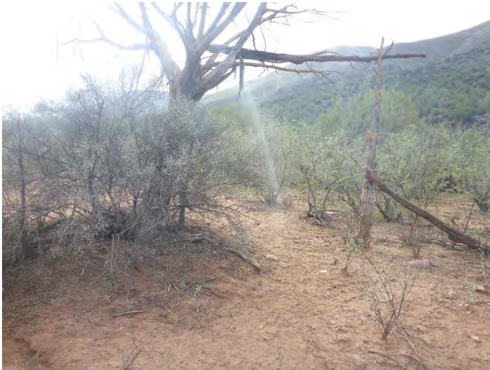
Oak Grove trap was to be completed by August 1, 2018. It appears fence is standing around it although the condition is poor and a limited attempt was made to “complete” it.