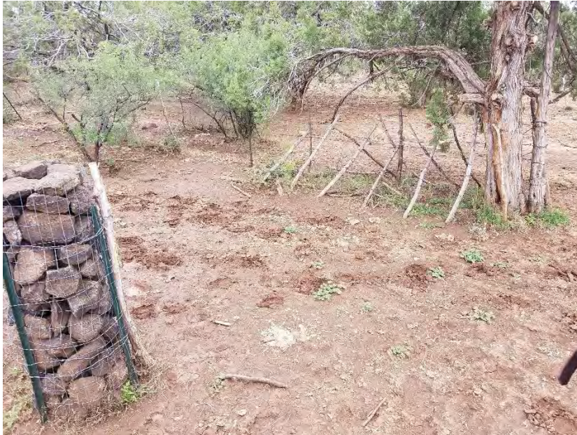
Fences down around Mid Polles tank. Gates have been open long enough for vegetation to grow in a sheltered areas where they are protected from grazing.

I rode around Mid Polles pasture. Seven animals were observed on the east end of the pasture. I heard more animals bawling but was unable to locate them. After riding around the pasture, I headed to Mid Polles tank. The tank was full of water and fence around it was recently repaired. All gates around the tank were down. While inspecting Mid Polles tank a branded bull came to the tank.