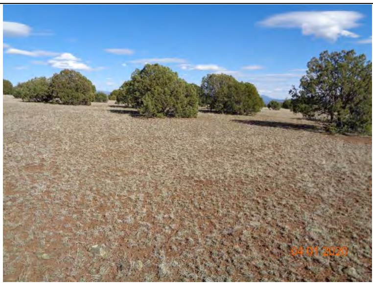
C6 Alma Mesa pasture