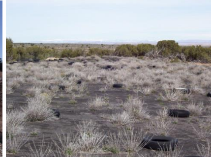
Cox Atkin Apron Before