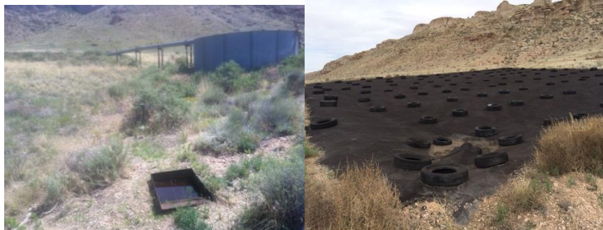
Grandstand catchment with wildlife Drinker and asphalt apron

The rancher has done a good job of keeping the aprons clean of plants and resurfacing the current asphalt apron but both of these aprons require too much upkeep and resurfacing to keep them in operation without redoing the apron completely. The rancher has agreed to do all of the labor laying the new apron and welding it together, if the aprons are bought and payed for.