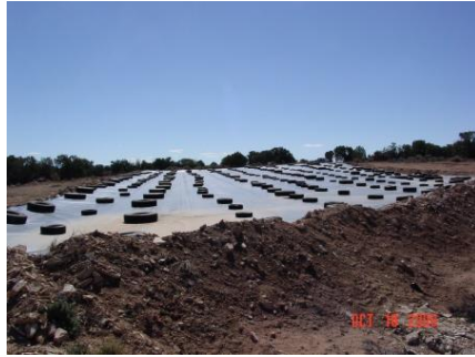
Cox Atkin Apron After

Below are a before and after photos of work that already was completed with the previous efforts: