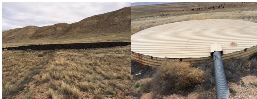
Toquer Tank Catchment apron and tank