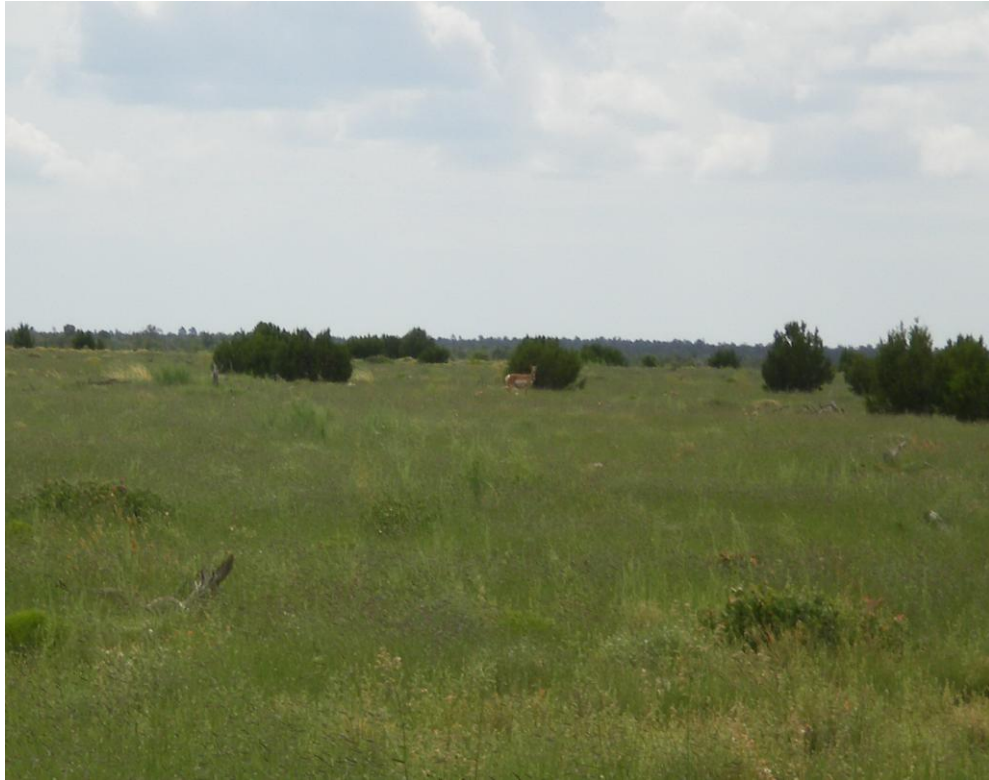
Antelope on Bar T Bar Allotment – Maverick Pasture next to east Clear Creek