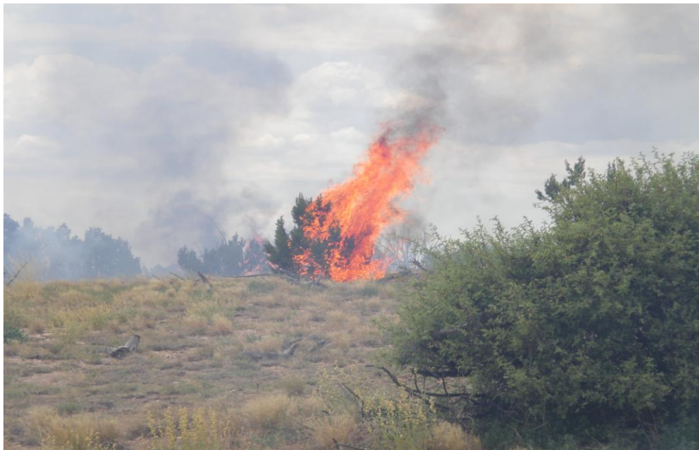
Juniper prescribed burning on Bar T Bar Allotment Maverick Pasture next to east Clear Creek, July 2010