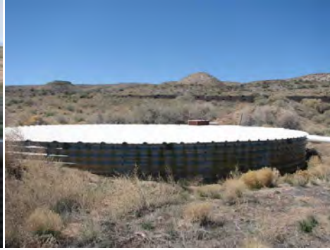
Pocum Tank Lid