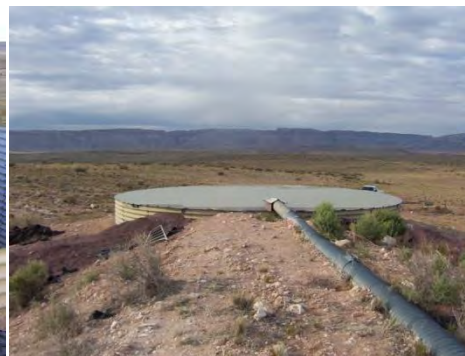
Higley Tank Lid After