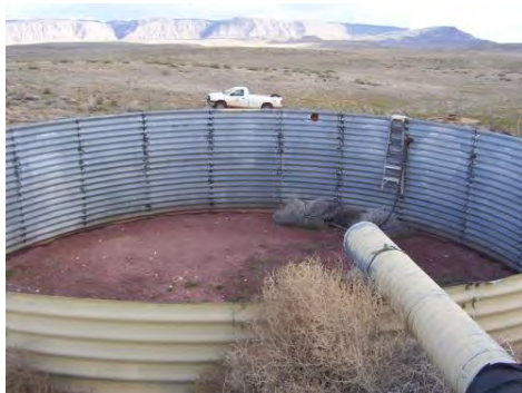
Higley Tank Before

Below are some before and after photos of work that already was completed with the previous efforts: