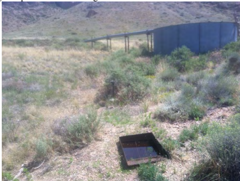
Grandstand catchment with wildlife Drinker

This is the only water that is found on the Grandstand in GMU 13B, both for cattle and wildlife. Concerns over Pronghorn fawning and the ability of Pronghorn to have available water during fawning have been documented as potential limiting factors to the growth of the Strip populations. There are similar concerns over the mule deer population. A catchment that has limited collection ability and high evaporation in the storage tank is of limited value to these animals.