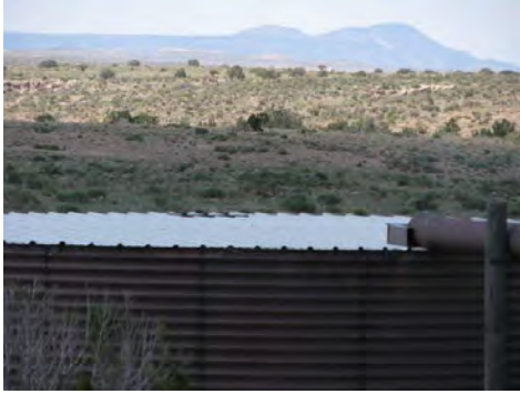
Diamond Butte Tank Lid