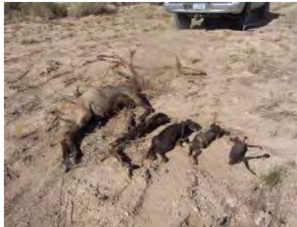
Dead Animals Removed from storage tank Twist Hills 2007: From Left to Right – Mule Deer Buck, Hind quarter of antelope, coyote, coyote, jackrabbit.

“...it would be improving upon the project by eliminating the ability of animals and humans for that matter from gaining access to the tank and drowning and polluting the water. It would further serve to reduce evaporation and help ensure an adequate water supply for wildlife during periods of drought that are common in our area.” – [REDACTED], 2007.