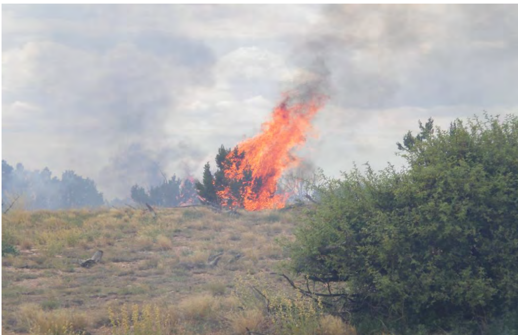
Juniper prescribed burning on Bar T Bar Allotment Maverick Pasture next to east Clear Creek, July 2010