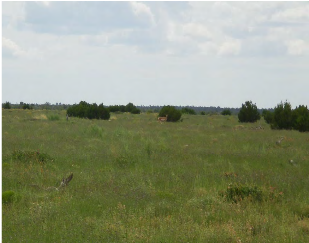
Antelope on Bar T Bar Allotment – Maverick Pasture next to east Clear Creek