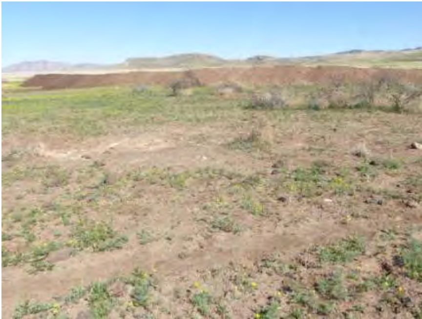
Overview of repaired dam