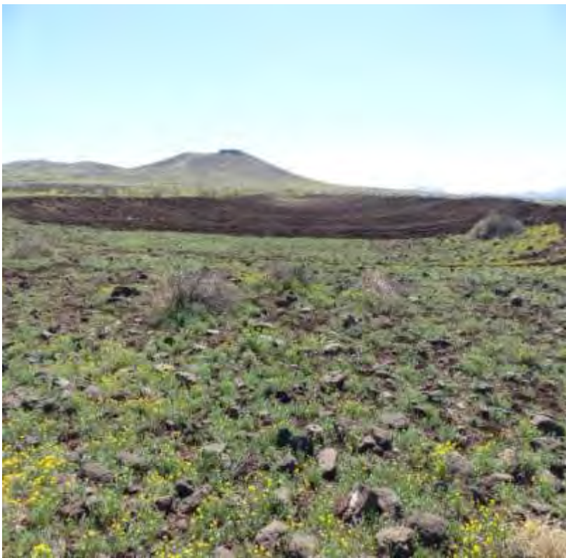
Overview of tank slope, and depth