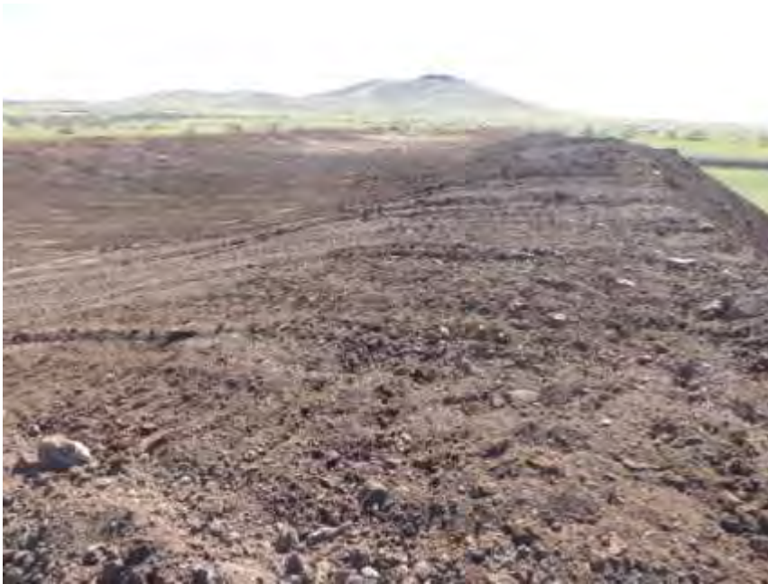
Slope and depth