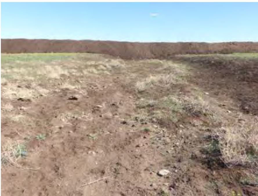
Downstream view of repaired dam